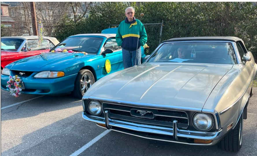
Frankfort Avenue Easter Parade March 30, 2024

Car shows and cruises are in full swing. We hope you come out and support the local shows and cruise-ins in our community. Also, the 60th birthday of the Ford Mustang is in April. Several members are going to Birmingham, AL for the celebration and various events. The MCA information packet is included in this newsletter in case you haven't received yours. Registration for this event is now closed.