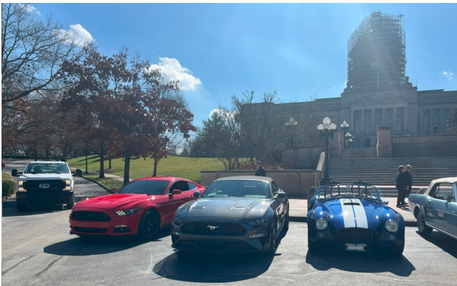
Frankfort Cruise and Capital Tour Feb 23, 2024

The calendar is filling up fast with events for the year. Get them Mustangs out and let them breathe! Looking forward to another busy and exciting year.