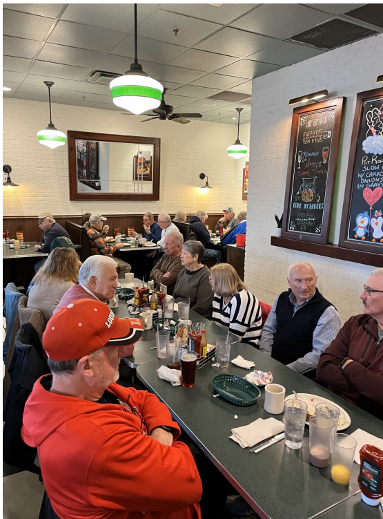
Club Breakfast January 2024

Car shows and parades and other events are just around the corner. Warm up them Mustangs and let's get ready to ride!