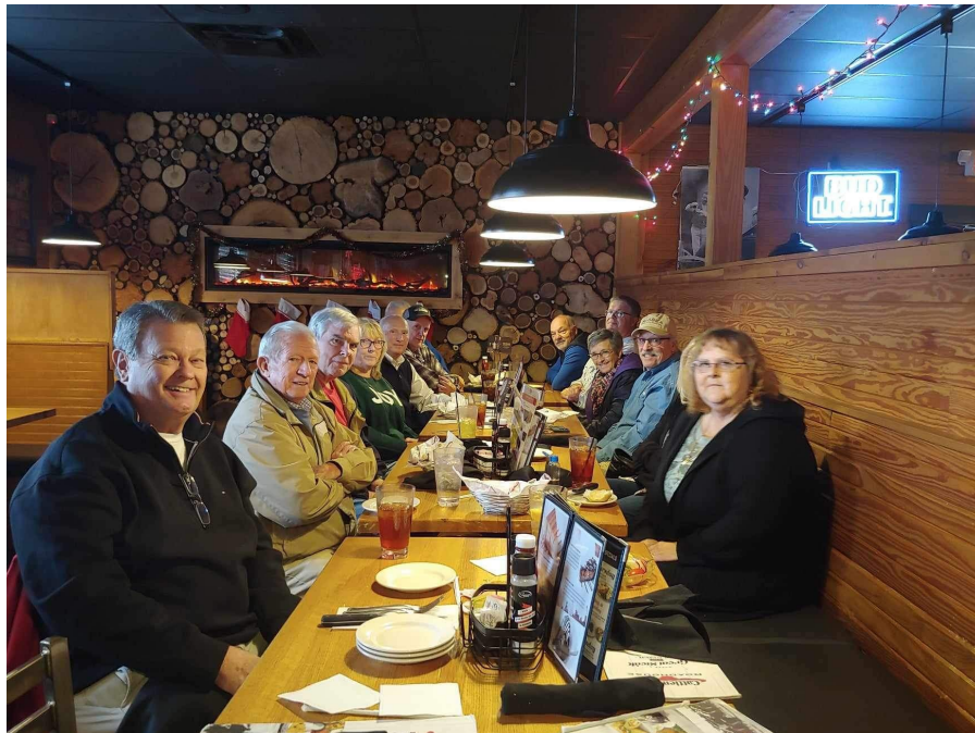
Club Luncheon December 2023

January meeting is our annual elections. It's not too late to volunteer to run for an office/position.