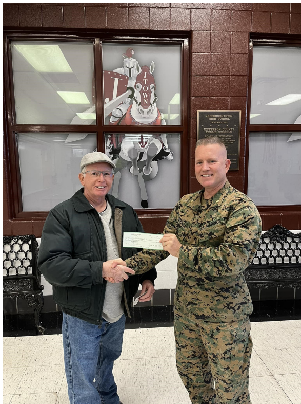
J-Town JROTC Fordfest Donation

Please take time to reflect and celebrate the upcoming holidays. I hope everyone had a great Thanksgiving. On behalf of all the club officers, we would like to wish everyone a Merry Christmas and a Happy New Year. We hope everyone stays healthy and rings in the New Year with family and friends.