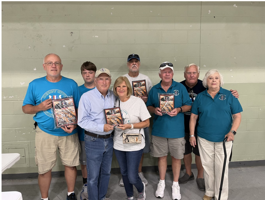
Bourbon City Camaro Club Car Show

Events, events, and more events! The club was well represented at several events. Thank you to all the members who came out to show your club pride! Fordfest is around the corner so come on out and support the club!