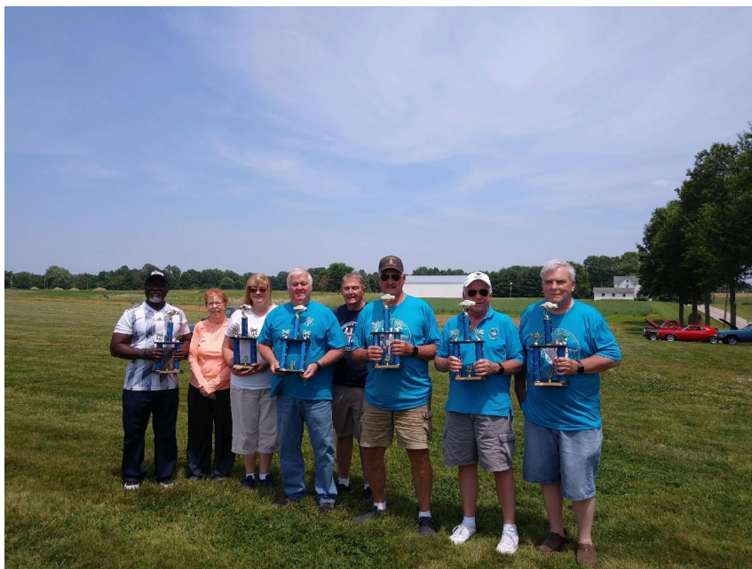
Huber's Cops for Kids Car Show

We have a fresh supply of new club shirts! We will have everything at our June meeting, so come prepared to get the latest DCMC apparel!